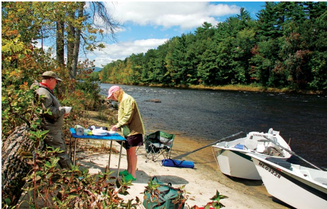
Maine shore lunches are legendary, and are a welcome part of trips on the smallmouth rivers. Here Lefty Kreh sips hot coffee while Bonnie Holding sets up a folding table on a small beach.

and fluorocarbon, from Frog Hair, along with what I call “Lefty Leaders.” These are hand-tied leaders with half of the leader being a 50-pound-test butt section (on a 9-foot leader, for example, the first 4.5 feet is 50-pound monofilament). The forward half of the leader tapers in 1-foot sections of 40-, 30-, and 20-pound mono, respectively, and then includes an 18- to 24-inch tippet of 12- or 15-pound mono or fluorocarbon attached to the leader with a surgeon’s loop or perfection loop. These leaders can be tied in a variety of lengths and really turn over flies nicely.